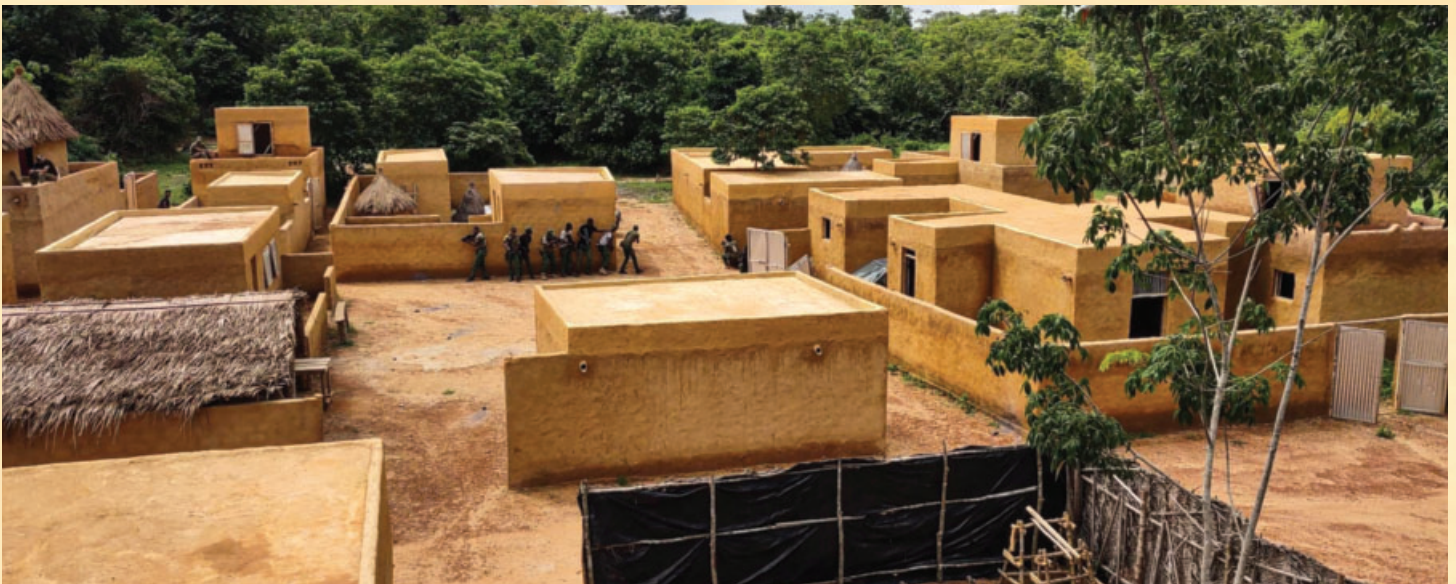
U.S. and Côte d'Ivoirian special operations forces conduct joint combined exchange training in Côte d'Ivoire July 5, 2021. The teams focused on honing basic skills such as close quarters combat, first aid, mission planning and jungle warfare.

U.S. Africa Command and special operations forces are committed to mutually beneficial engagement with partners.