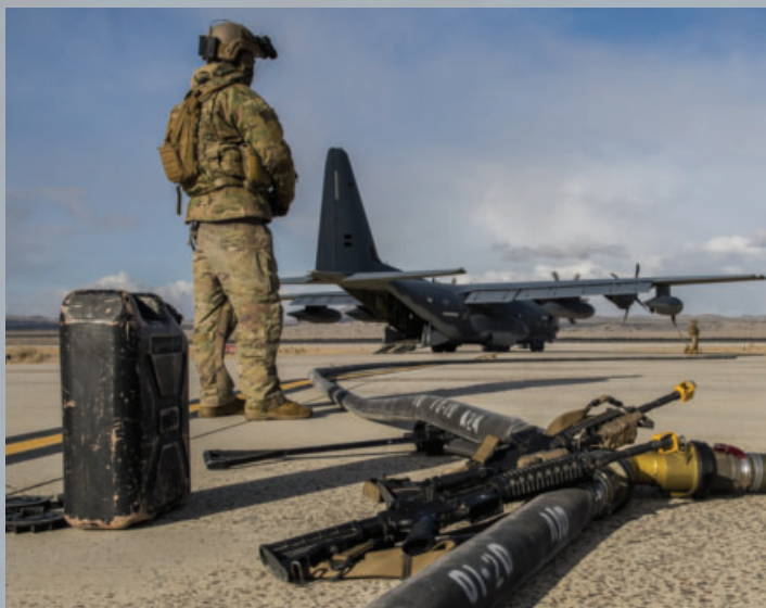
A forward area refueling point Airman assigned to the 27th Special Operations Mission Sustainment Team 1 provides perimeter security during the 27th Special Operations Wing operational readiness exercise at Dugway Proving Grounds, Utah, March 22, 2021. The Mission Sustainment Team concept provides a way forward in building small, scattered teams capable of operating independent of main operating bases.