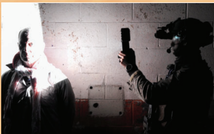
A Marine Raider photographs a simulated detainee during a RAVEN unit readiness exercise in Nashville, Tenn., May 11, 2021. RAVEN is a training exercise held to evaluate all aspects of a Marine Special Operations Company prior to a Marine Forces Special Operations Command deployment.

various other units from the Fleet Marine Force acted as partner-nation forces throughout the exercises. U.S. Army Special Forces acted as a peer-to-peer competition force, gathering information and attempting to disrupt the MARSOC's operational foothold.