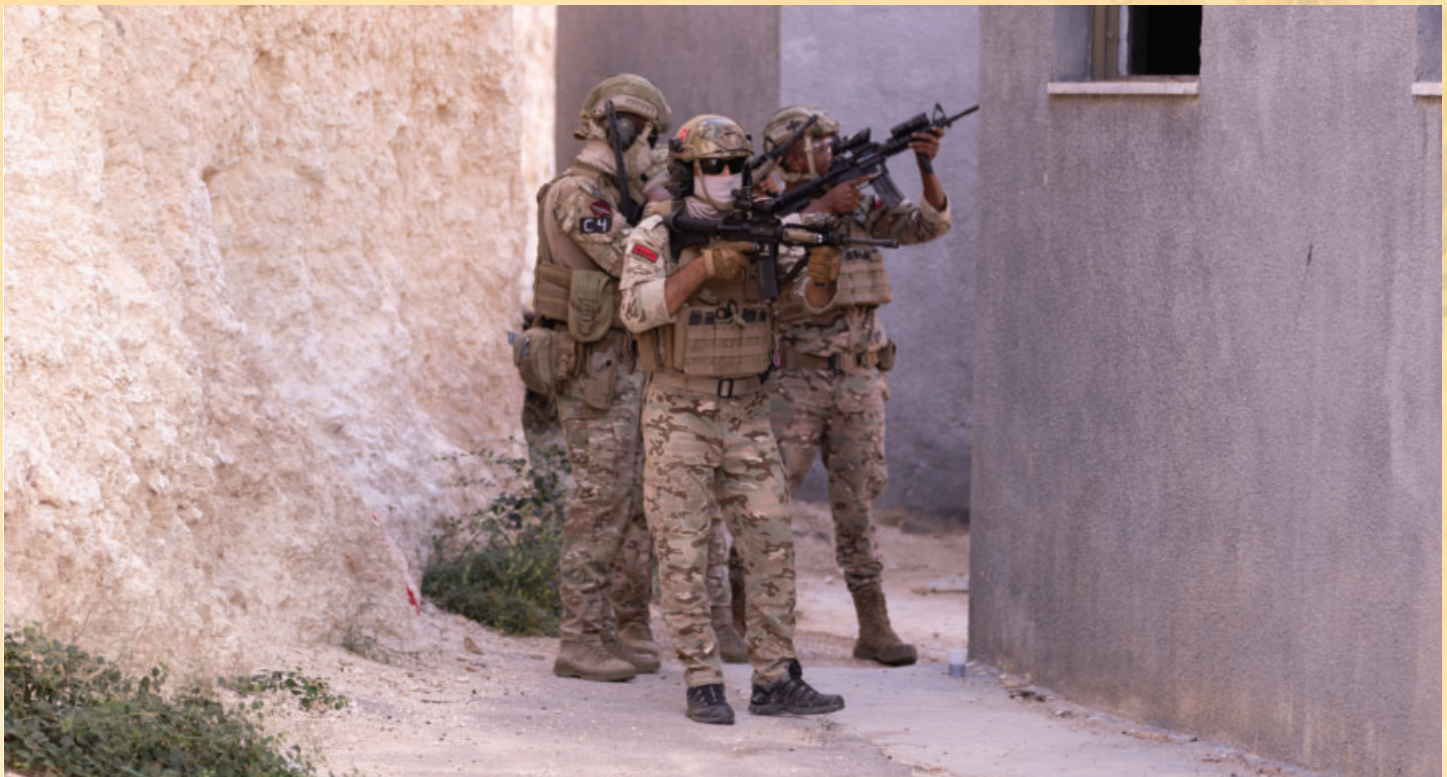
Soldiers with the Jordanian 101st Special Forces Unit secure a building while team members conduct close-quarters battle during joint combined exchange training with U.S. Army 5th Special Forces Group (Airborne), near Amman, Jordan, June 2021. JCETs allow U.S. SOF to improve and share their military tactics and skills in new settings while increasing bilateral relations and meeting common security challenges within the U.S. Central Command's area of operations.

Being Special Forces is more than just being physically fit and able to shoot, it's about understanding the different operational environments; building relationships with host nations and learning from the people make these opportunities valuable.