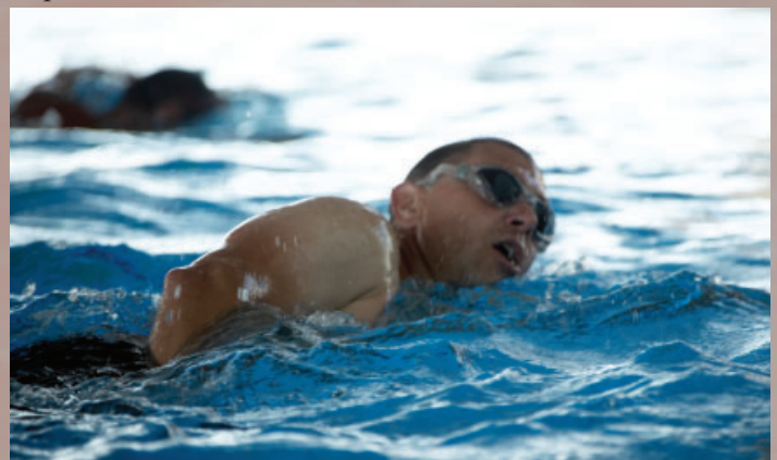
Naval Special Warfare Leader Assessment Program participants undergo physical performance testing during an NLAP pilot, June 14, 2021. NLAP, run by Naval Special Warfare Center, is NSW's new initiative to transform how it selects and promotes future leaders, increasing precision and selectivity in the assignment process for officer and enlisted leadership.

Naval Special Warfare Center, located on Naval Amphibious Base Coronado, provides initial assessment and selection and subsequent advanced training to the Sailors who make up the Navy’s SEAL and Special Boat communities. These communities support the NSW mission, providing maritime special operations forces to conduct full-spectrum operations, unilaterally or with partners, to support national objectives. For more information on the NSW pipeline, visit https://www.sealswcc.com/ .