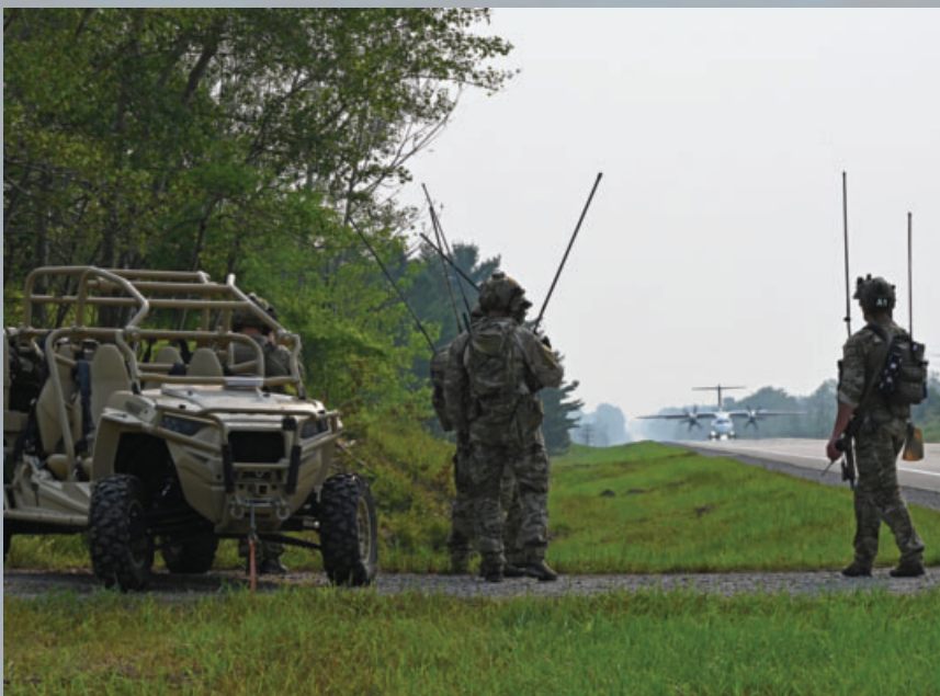
A U.S. Air Force 492nd Special Operations Wing C-146A Wolfhound, with ground air traffic control and guidance provided by Special Tactics operators from the 24th Special Operations Wing, lands on a closed public highway Aug. 5, 2021 at Alpena, Mich., for the first time ever as part of a training exercise during Northern Strike 21. The joint training event tested part of the agile employment concept, focusing on projecting combat power from austere locations.

airfield or in this case, the closed public highway. Special Tactics Airmen are a special operations ground force, experienced in conducting global access missions such as establishing austere landing zones around the world.