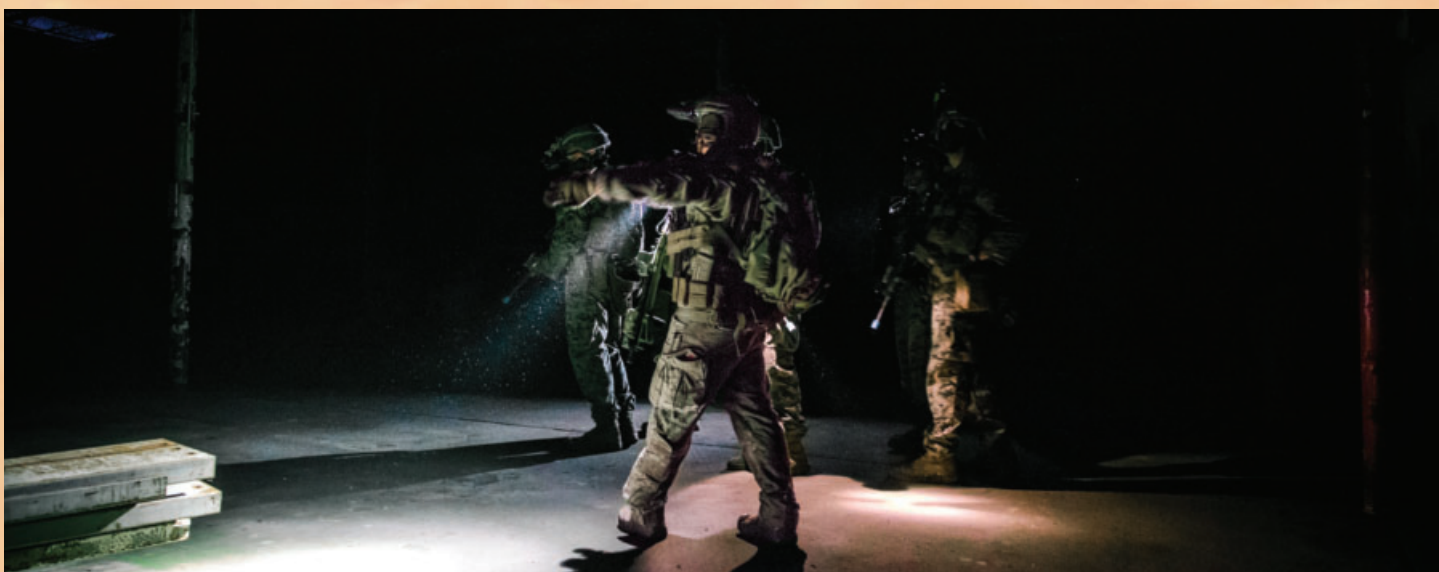
U.S. Marines with 3rd Battalion, 2d Marine Regiment (3/2), 2d Marine Division, and Marine Corps Forces Special Operations Command search a building during a night raid as a part of Exercise Raven in Nashville, Tenn., May 24, 2021. Exercise Raven is an integrated training event with Marines from 3/2 and MARSOC which simulates real-life tactical scenarios to enhance overall unit interoperability, effectiveness and lethality against an adversarial force.

To learn more about the Marine Raider Regiment and other MARSOC units, visit https://www.marsoc.marines.mil/