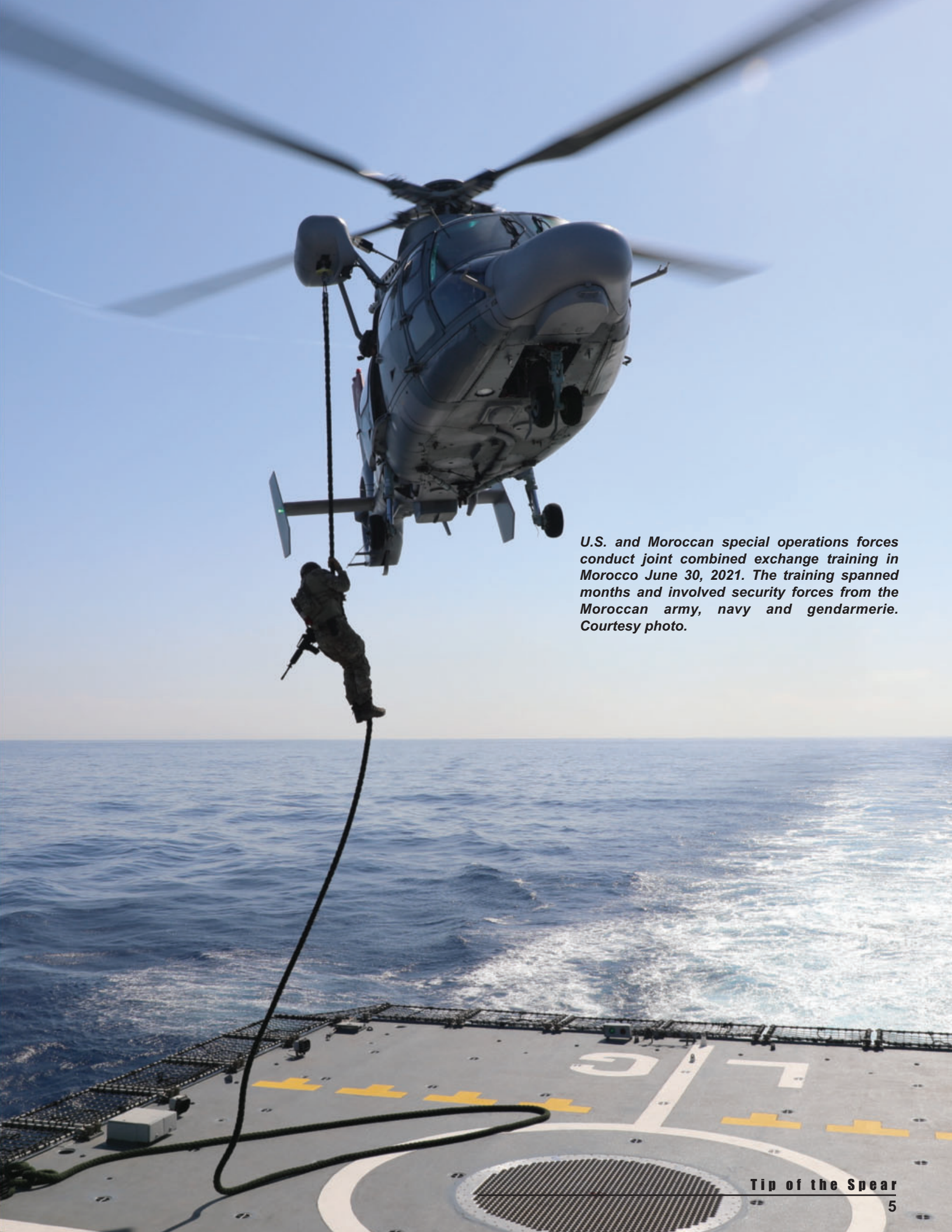
U.S. and Moroccan special operations forces conduct joint combined exchange training in Morocco June 30, 2021. The training spanned months and involved security forces from the Moroccan army, navy and gendarmerie.