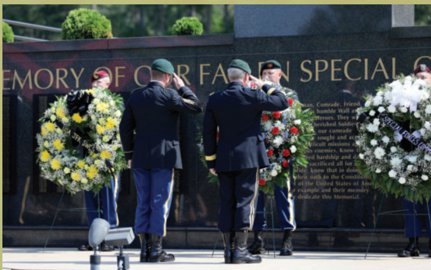
U.S. Army Soldiers unveil the names of fallen Special Operations Forces on the U.S. Army Special Operations Command Memorial Wall during a ceremony at the USASOC Memorial Plaza on May 27, 2021.

Following remarks, the black curtain concealing the wall