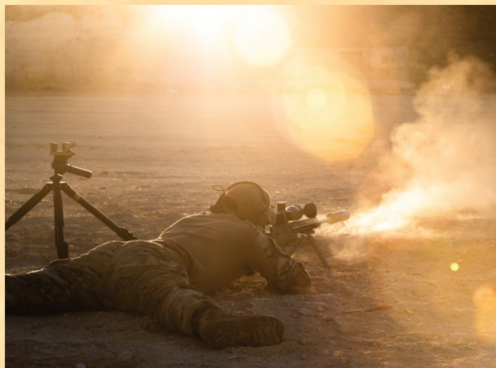
A Dutch Special Forces sniper engages targets downrange during morning shooting rehearsals at the International Specialty Training Center's Desert Sniper course in Chinchilla, Spain July 14, 2021.