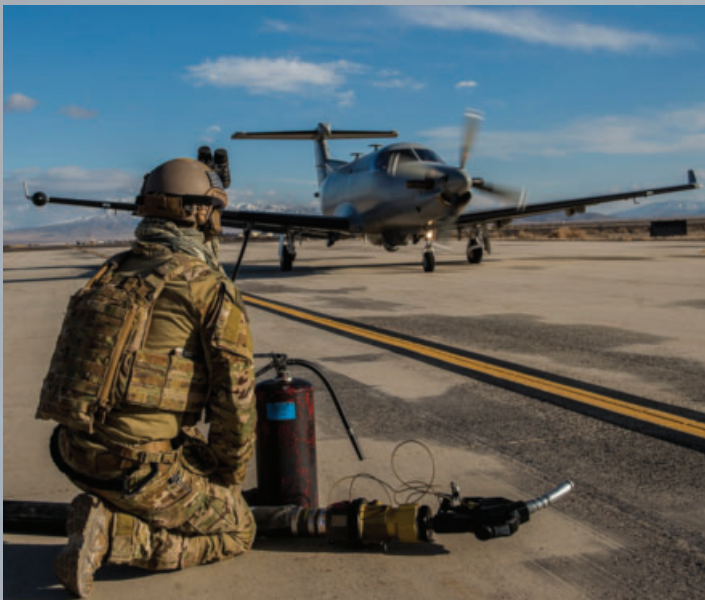
A forward area refueling point Airman assigned to the 27th Special Operations Mission Sustainment Team 1 provides perimeter security during the 27th Special Operations Wing operational readiness exercise at Dugway Proving Grounds, Utah, March 22, 2021. The Mission Sustainment Team concept provides a way forward in building small, scattered teams capable of operating independent of main operating bases.