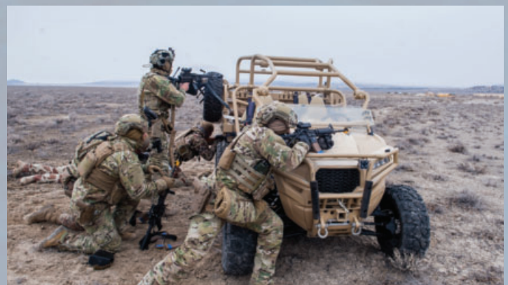
Security forces Airmen assigned to the 27th Special Operations Mission Sustainment Team 1 provides security during a 27th Special Operations Wing operational readiness exercise at Dugway Proving Grounds, Utah, March 22, 2021. The Mission Sustainment Team concept provides a way forward in building small, scattered teams capable of operating independent of main operating bases.

MST 1 may be new, but they have their work cut out for them. Providing support for active personnel at austere and un-furnished locations is no easy feat, but it means the work done by MST 1 will be vital in helping similar units in AFSOC for years to come.