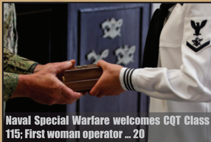
Naval Special Warfare welcomes CQT Class 115; First woman operator ... 20