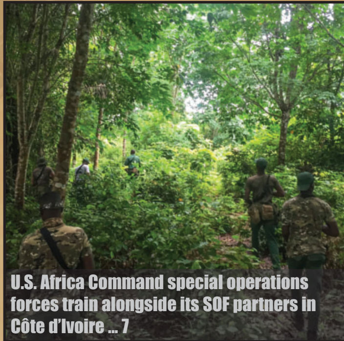
U.S. Africa Command special operations forces train alongside its SOF partners in Côte d'Ivoire ... 7