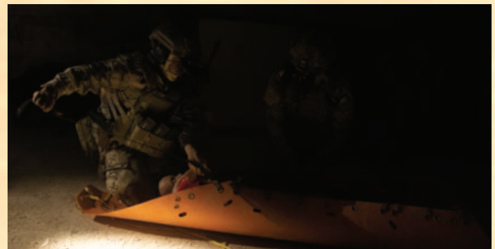
Members of the Jordanian 101st Special Forces Unit perform a medical evacuation in a subterranean environment during joint combined exchange training with the U.S. Army 5th Special Forces Group (Airborne) near Amman, Jordan, June 2021. This marks the first time the two forces conducted subterranean training together.

The 6-week JCET included training such as small unit leaders and noncommissioned officers development, small arms training, operational planning, close quarter combat, physical fitness, field medical activities and subterranean training. JCETs are part of Special Operations Command Central's Theater Security Cooperation program with partner countries across U.S. Central Command's area of responsibility.