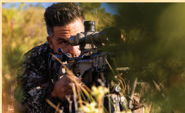
A Greek Special Forces sniper instructor from the International Specialty Training Center surveys his surroundings at the ISTC Desert Sniper Course in Chinchilla, Spain on July 15, 2021.