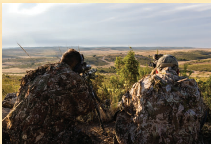
German and Greek Special Forces instructors from the International Specialty Training Center conduct a live-fire exercise at the ISTC Desert Sniper Course in Chinchilla, Spain on July 15, 2021.