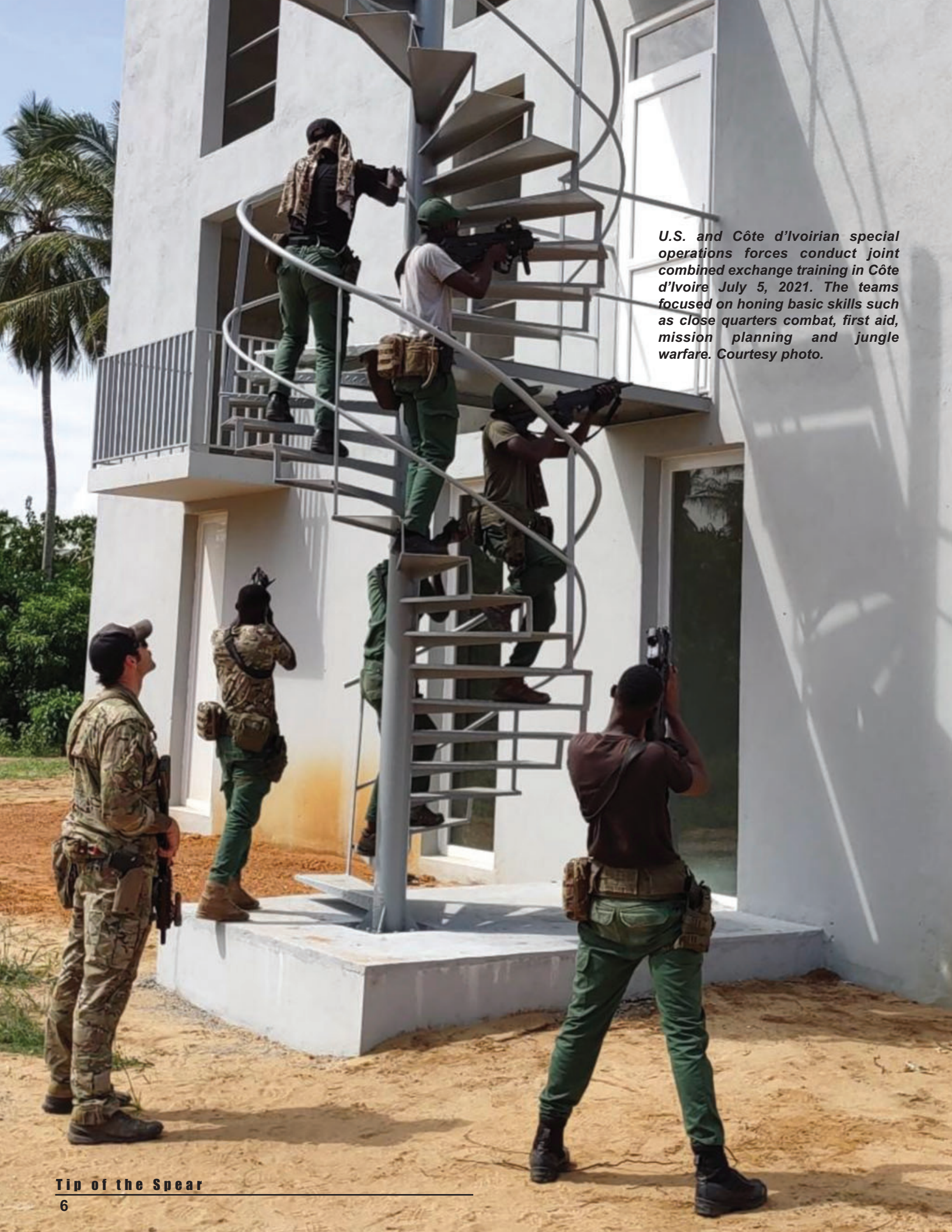
U.S. and Côte d'Ivoirian special operations forces conduct joint combined exchange training in Côte d'Ivoire July 5, 2021. The teams focused on honing basic skills such as close quarters combat, first aid, mission planning and jungle warfare. Courtesy photo.