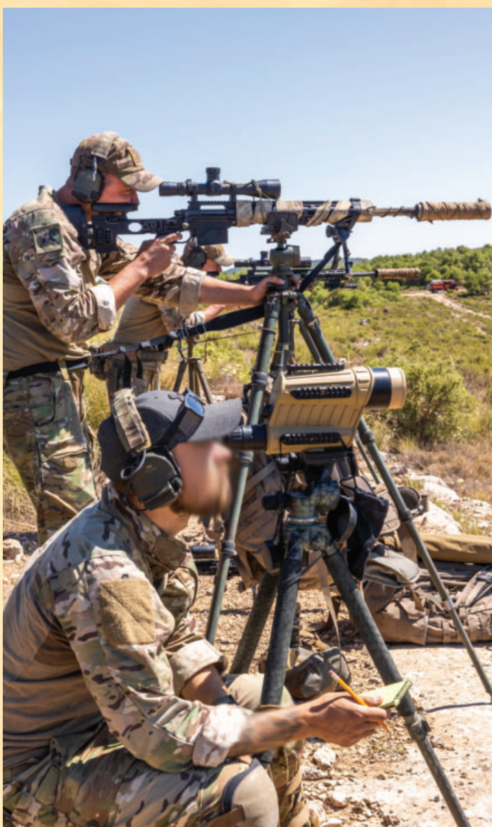
A three-man Dutch Special Forces sniper team engages multiple targets in sequence at the International Specialty Training Center's Desert Sniper course in Chinchilla, Spain July 14, 2021.