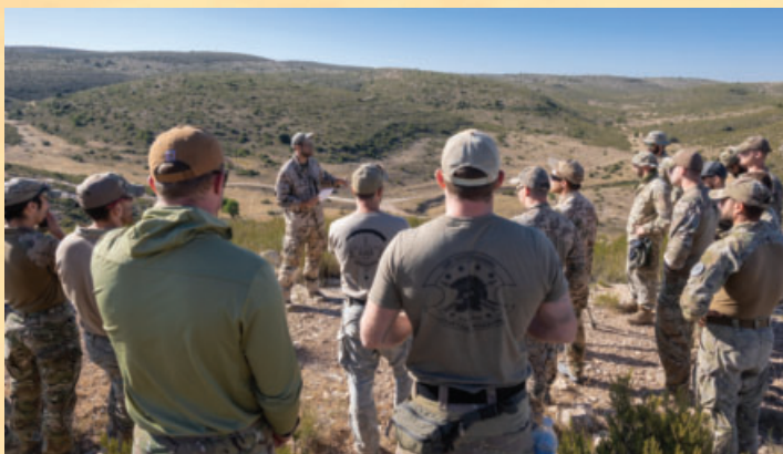
A German International Specialty Training Center sniper instructor speaks to the class of the 2021 Desert Sniper course in Chinchilla, Spain July 14, 2021.