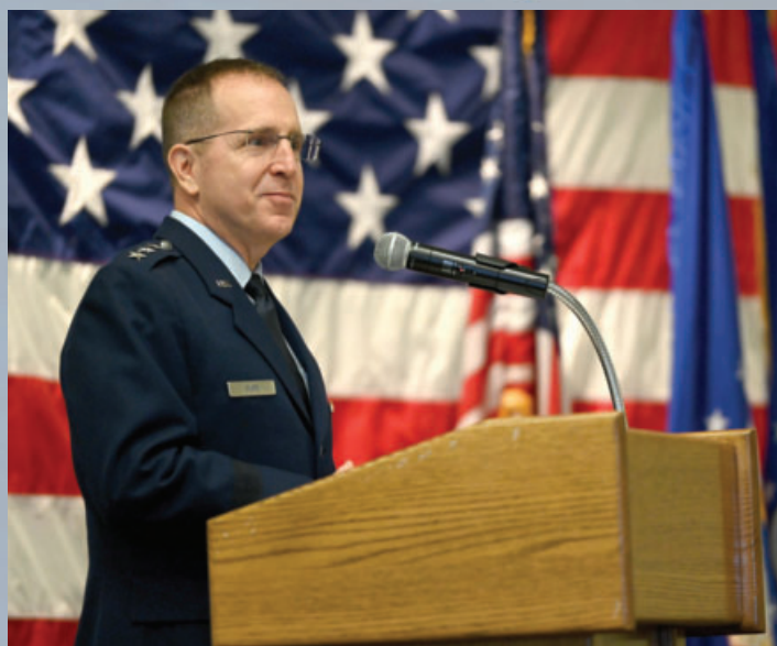
U.S. Air Force Lt. Gen. Jim Slife, commander of Air Force Special Operations Command, speaks during the AFSOC Operations Center change of command ceremony at Hurlburt Field, Fla., June 24, 2021. AFSOC provides Air Force special operations forces for worldwide deployment and assignment to unified combatant commanders. The command has approximately 20,800 active-duty, Reserve, Air National Guard and civilian professionals.

independent of main operating bases such as large