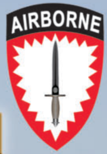
Photo essay by U.S. Army Sgt. Patrik Orcu U.S. Special Operations Command Europe

An Italian Special Forces sniper looks downrange at his targets during morning shooting rehearsals at the International Specialty Training Center's Desert Sniper course in Chinchilla, Spain July 15, 2021. ISTC is a multinational education and training facility for tactical-level, advanced and specialized training of multinational special operations forces and similar units, employing the skills of multinational instructors and subject matter experts.