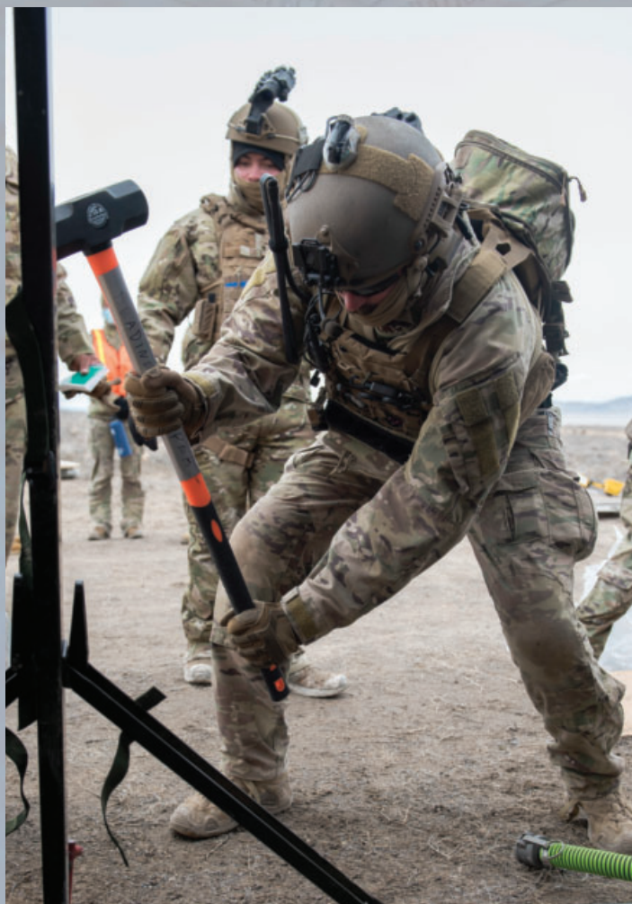
An explosive ordinance disposal technician assigned to the 27th Special Operations Mission Sustainment Team 1 secures a post for an Alaska Small Shelter during the 27th Special Operations Wing operational readiness exercise at Dugway Proving Grounds, Utah, March 22, 2021. The Mission Sustainment Team concept provides a way forward in building small, scattered teams capable of operating independent of main operating bases.

“Our challenge in leadership is to ensure that those middle school kids today who will put an AFSOC patch on in 10 years know when they come to AFSOC, they’ll still be relevant.”