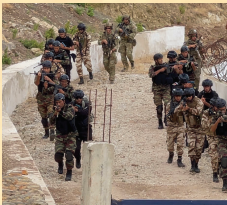
U.S. and Moroccan special operations forces conduct joint combined exchange training in Morocco July 9, 2021. The training spanned months and involved security forces from the Moroccan army, navy and gendarmerie.

“The JCET is yet another excellent example of the close and enduring security partnership between the United States and Morocco,” said Chargé d’affaires Lawrence Randolph of the U.S. Embassy in Morocco. “It comes as we are celebrating the bicentennial of the Tangier American Legation, our first diplomatic post in